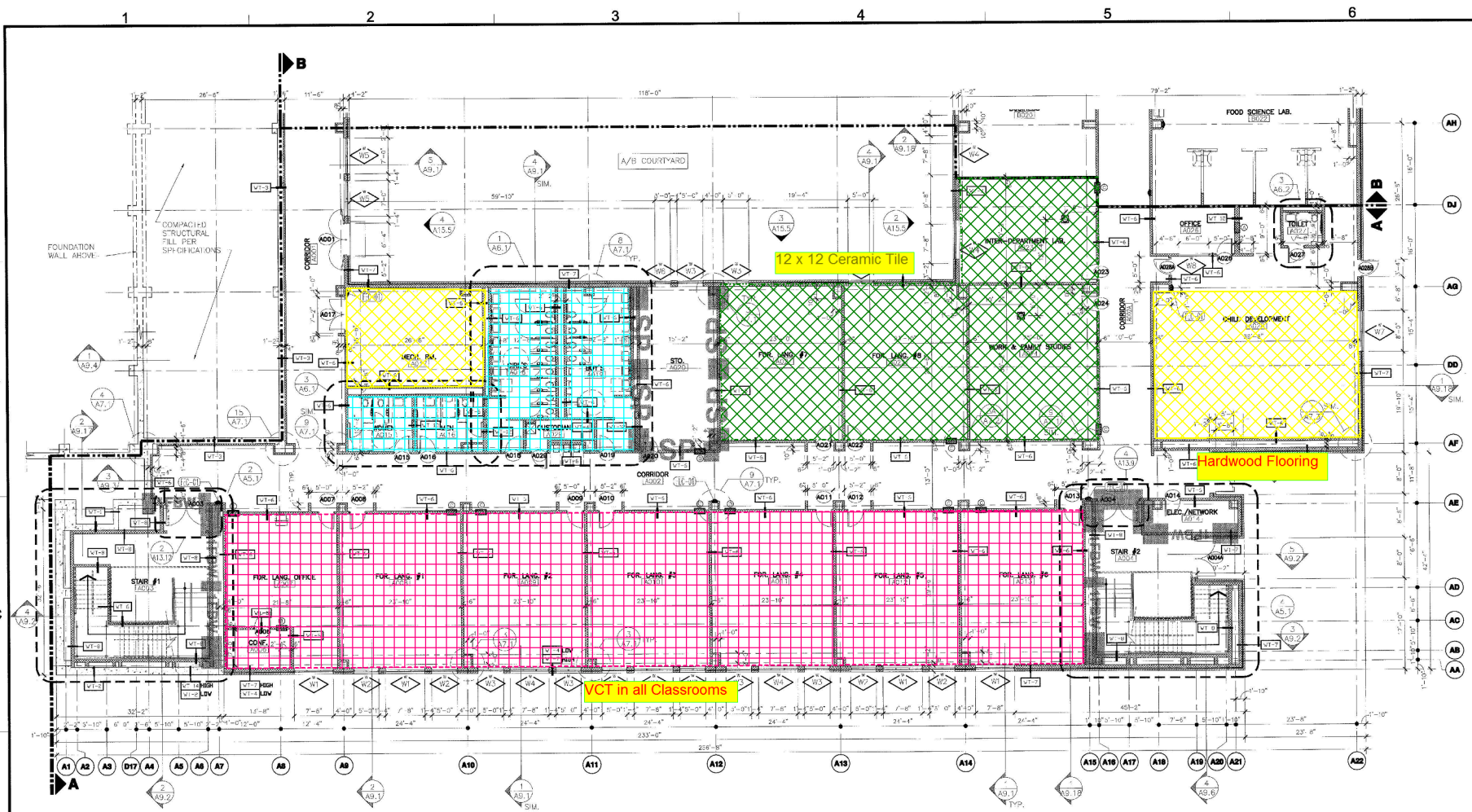
FLOOR PLAN, LOWER LEVEL - AREA 'A'

NOTE: SEE STRUCTURAL DOCUMENTS FOR BRICK LEDGE / WALL ELEVATIONS.